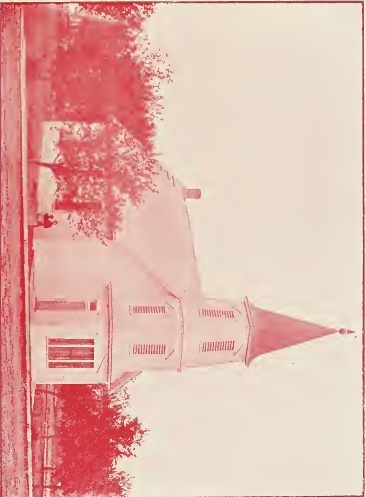
Presbyterian Church, Scandia, Kansas.